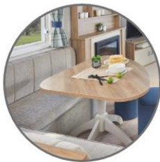
Fixed dinette seating